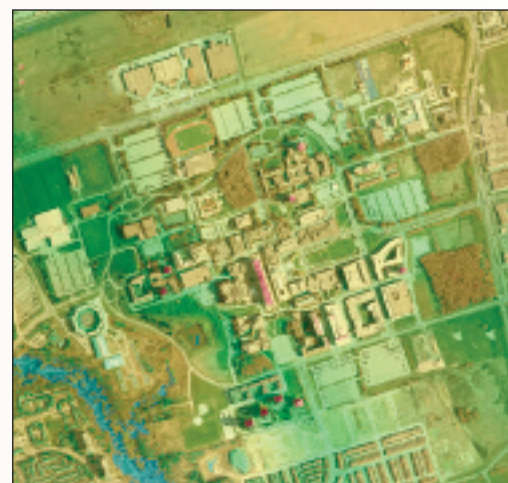
High resolution satellite image of York University.